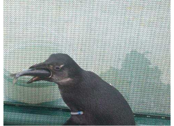
A SAMREC penguin enjoying an Ocean Fresh sardine

As always we would like to acknowledge and thank Oceanfresh Seafoods for the supply of Sardines for our Penguins. Your contribution is very much appreciated. Please support Ocean Fresh in acknowledgment of their kind assistance to our Penguins.